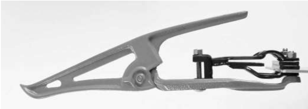
8B Mounted on Schumacher SCH Easy Cut Guard